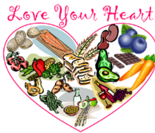
A Month-Long Celebration of Heart-Healthy Recipes February 2012